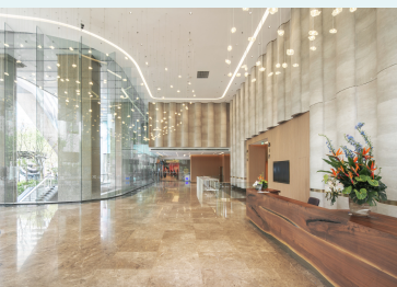
Shui On Plaza

In March 2022, CCP12 opening a separate legal entity in Amsterdam, The Netherlands. This new presence in Europe increases the flexibility and capacity of CCP12 to better serve its membership and conduct its mission. We are also delighted that staff based in Europe now has a based in closer proximity.