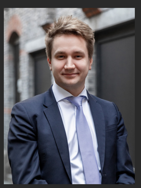
TEO FLOOR CCP12 CEO