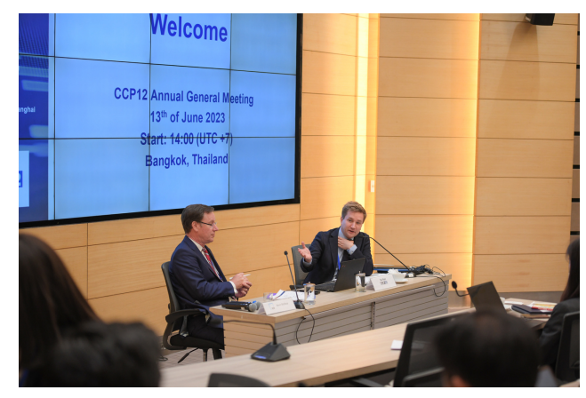
CCP GLOBAL ANNUAL GENERAL MEETING IN BANGKOK